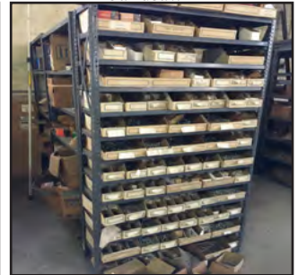
Hardware, screws, racking