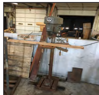
Rockwell drill press