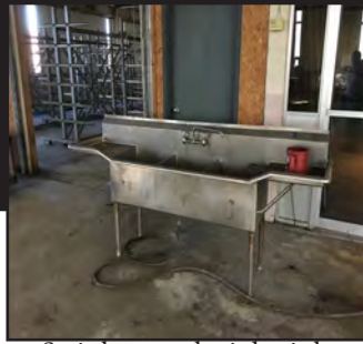
Stainless steel triple sink