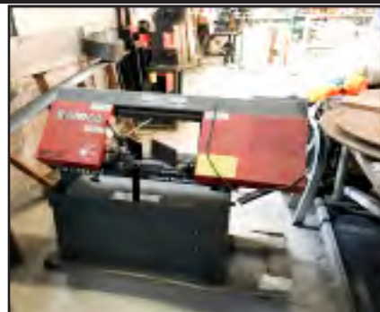
Ramco metalcutting bandsaw model RS-90P SN10911