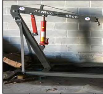
Ramco cherry-picker, 5,000 lb.