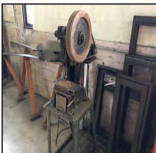
Alva F. Allen 5 ton punch press