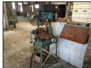
Enco milling and drilling machine and full set of tooling

Cash, check, or major credit card. 10% buyer's premium