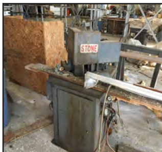
Stone metal miter saw-no blades