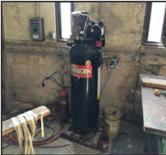
(16) racks 18' long, 5' wide, 8' tall- 1/4" heavy steel racks