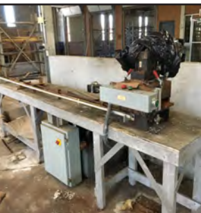
Hydraulic punch press