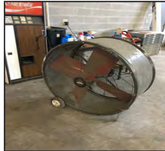
Heat Buster large fan