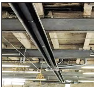
(6) 16 foot radiant gas heaters (3) 10 foot u-shaped radiant gas heaters All heaters are like new and run off of gas and 110V!