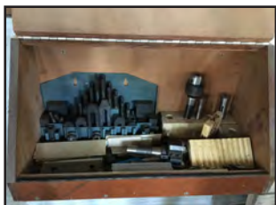
Enco milling and drilling machine and full set of tooling