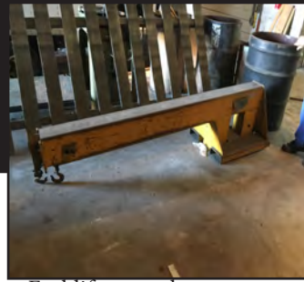
Forklift crane boom