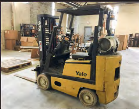
Yale 4000 lb. with 2 tanks forklift 4243 hours -runs