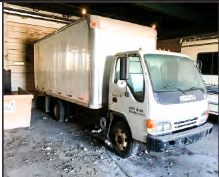
1998 Isuzu box truck with 18' x 8' box, runs roughly, high mileage