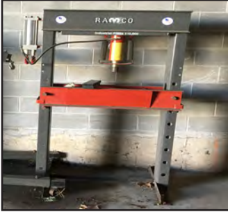
Ramco 110,000 lb. press