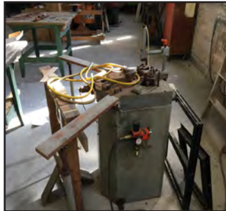
Muhlacker crimper SN21132