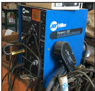
Miller Regency 200 wire welder-nice

Find parking at public lots within walking distance.