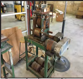
Custom bending machine