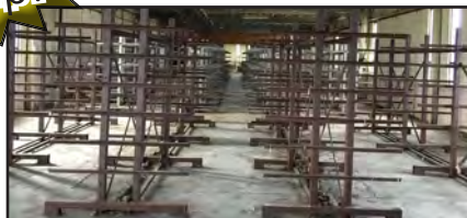
(16) racks 18' long, 5' wide, 8' tall- 1/4" heavy steel racks