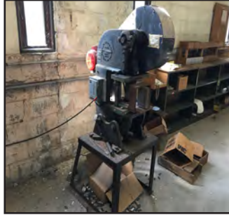
Alva Allen 8 ton punch press