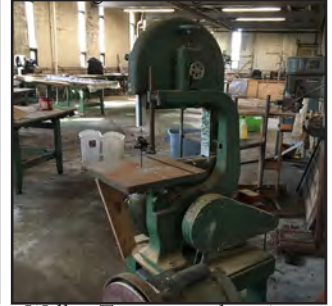
Walker Turner metal cutting bandsaw